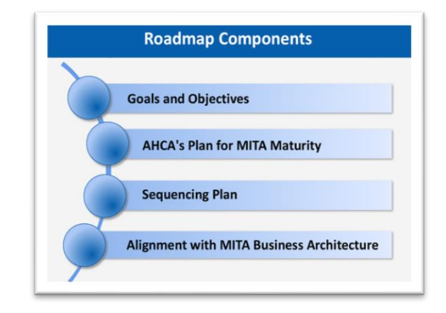
Exhibit 4-3: MITA Roadmap Components

The SS-A Companion Guide provided with the MITA 3.0 Framework describes the MITA Roadmap as containing the four key components illustrated in Exhibit 4-3: MITA Roadmap Components. First it addresses goals, objectives, activities, and milestones for a five-year outlook for proposed system solutions. Second, it describes AHCA's plan to improve in MITA maturity over the five-year period and provides the anticipated timing for full MITA maturity. Next, the MITA Roadmap provides a sequencing plan, which considers cost, benefit, schedule, and risk information. Finally, it ensures that Florida Medicaid's Business Architecture conforms to its MITA ConOps and to the MITA Business Process templates. If any processes differ from the way they are described in the templates, those are noted in the MITA ConOps.