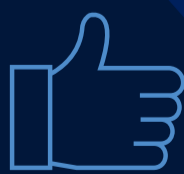
MEETING PATIENT EXPECTATIONS