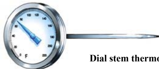
Dial stem thermometer

The type of thermometer most available, appropriate, and practical for checking the hot water is a dial stem-type food thermometer. This thermometer usually has a temperature range from 0°F to 220°F.